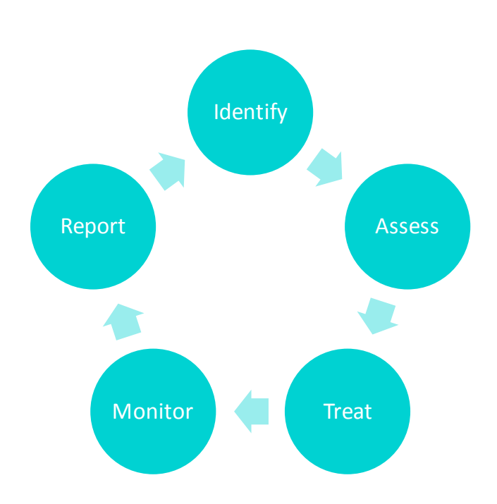
Fig 1 - The Risk Management Process

More information on the activities undertaken at each stage of the risk process are detailed in the forthcoming chapters of this document.